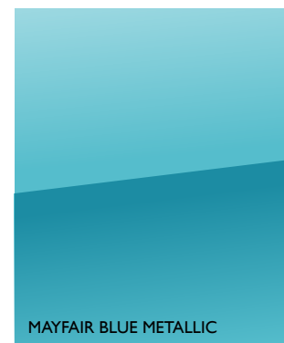
MAYFAIR BLUE METALLIC