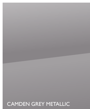
CAMDEN GREY METALLIC