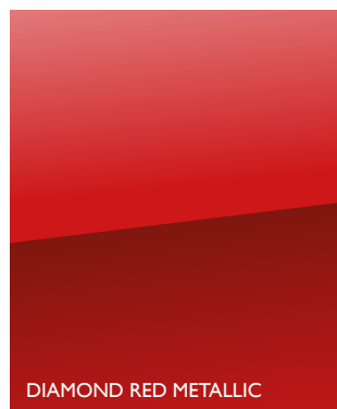
DIAMOND RED METALLIC