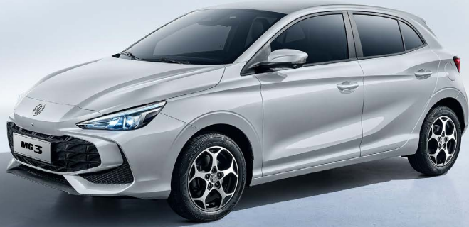
SLOANE SILVER METALLIC