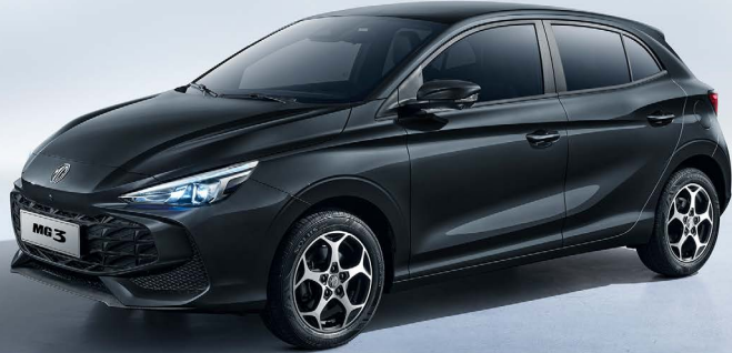
BLACK PEARL METALLIC