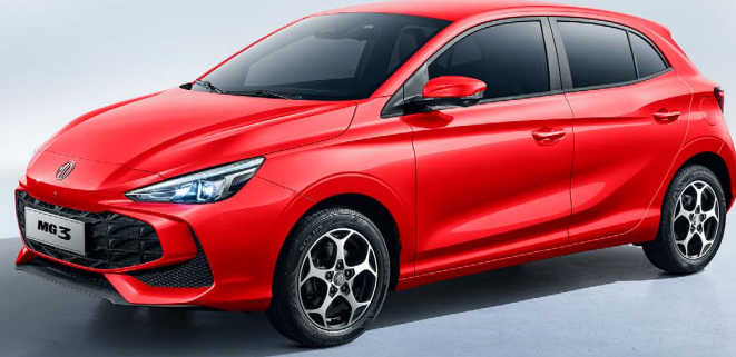
DIAMOND RED METALLIC