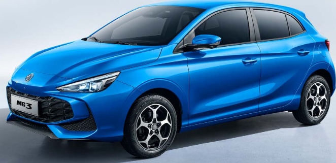
BRIXTON BLUE METALLIC