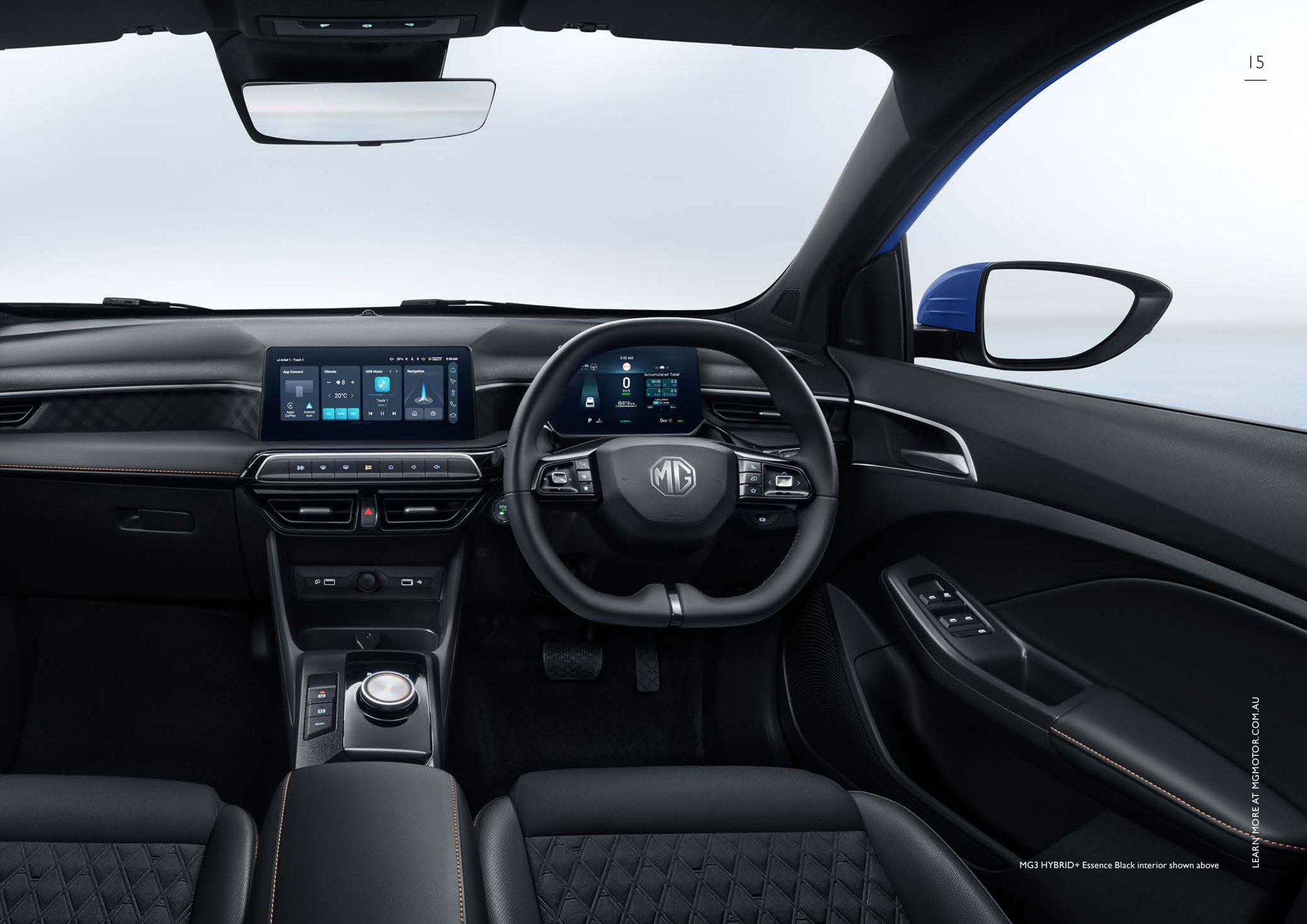
MG3 HYBRID+ Essence Black interior shown above