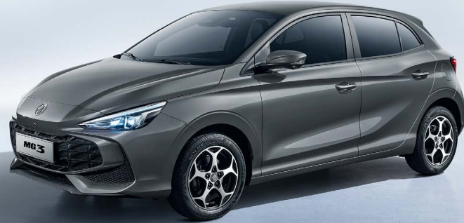
HAMPSTEAD GREY METALLIC